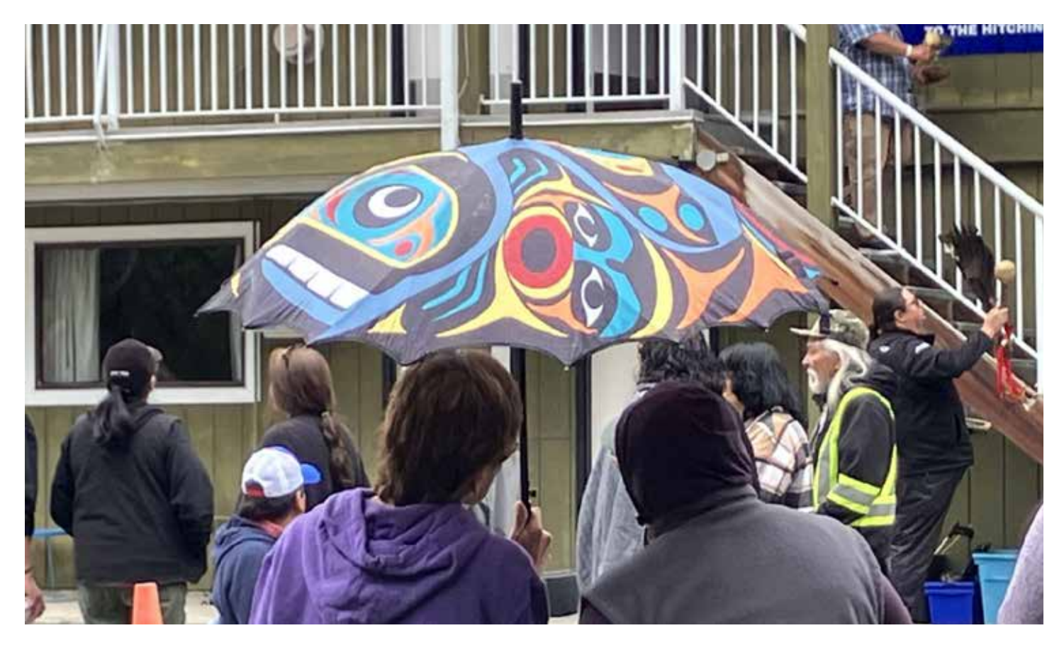
Spirits were bright as people gathered to witness the Land Blessing at the Hitching Post Motel's Grand Opening day.