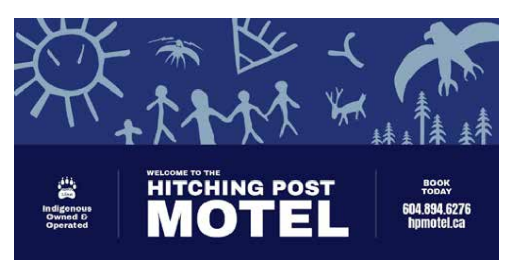
Retail Operations has stepped into tourism with the purchase of the Hitching Post Motel.

For the first time since its expansion and relocation more than a decade ago, the store turned a turned a profit. Tsípun's success can be partially attributed to offering popular brands like President's Choice and No Name, which are not available at grocery stores in nearby Pemberton.