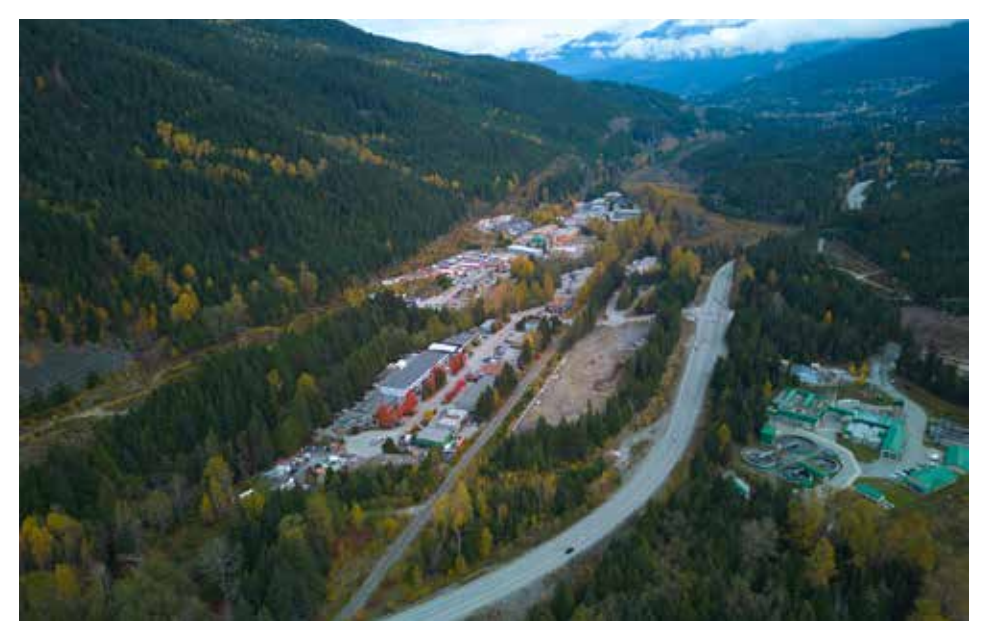
Construction of Tseqwtsúqum, on 5.3 acres in Function Junction, is planned to start June 1, 2025.

which will serve as a vital cultural and gathering space.